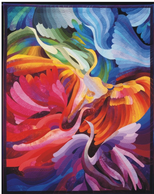
Birds of a Different Color • 93" x 74" • Copyright © 1999, Caryl Bryer Fallert • Bryerpatch Studio • www.bryerpatch.com

The focus of Caryl's work is on the qualities of color, line, and texture, which will engage the spirit and emotions of the viewer, evoking a sense of mystery, excitement, or joy. Illusions of movement, depth, and luminosity are common to most of her work. The inner glow is created by hand dyeing or painting her fabrics in gradual progressions from light to dark.