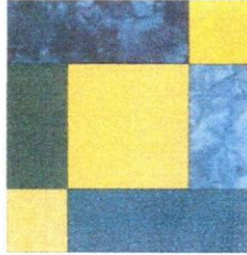
BLOCK A – MAKE 18