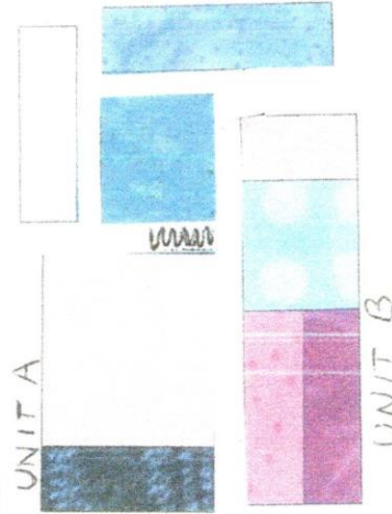
block assembly sections